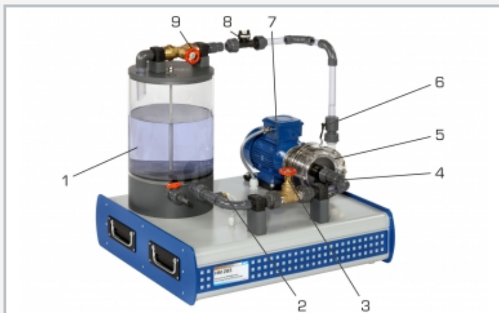
1 water tank, 2 temperature sensor, 3 valve at inlet, 4 pressure sensor at inlet, 5 pump, 6 pressure sensor at outlet, 7 motor, 8 flow meter, 9 valve at outlet